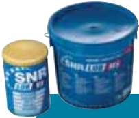
SNR LUB greases